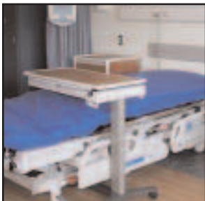
Cleans floors, walls, bathrooms, lockers.

germicidal ability of RX 15 has been greatly improved. It is now proven to kill Pseudomonas aeruginosa , Human Immunodeficiency Virus Type 1 (HIV-1) (associated with AIDS). Effective against Canine Parvovirus at 12 ounces per gallon. Use RX 15 in bathrooms, kitchens, offices, nursing homes, locker rooms, showers, etc.