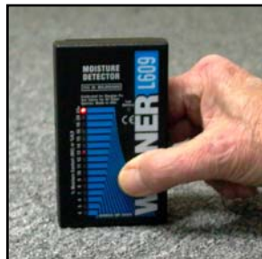
Fast drying allows quick opening of cleaned area.