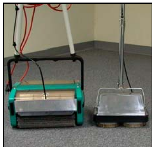
Great cleaning of any carpet with any equipment.

RX 82 is highly concentrated and economical to use, but its biggest saving is by not resoiling. It postpones or eliminates the cost of future cleanings. Use on carpets of all kinds and used with any method (as a prespray, spotting, extraction, self-contained and truck mount) bonnet cleaning, rotary shampooing, low moisture spray & brush and spot cleaning).