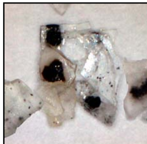
Dries to non-stick crystals with soil captured inside.