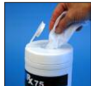
Premoistened & ready to use anti-bacterial cleaner.