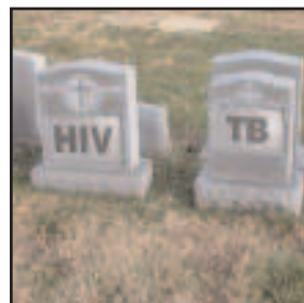
Suitable for clean-up of blood and OPIMs.