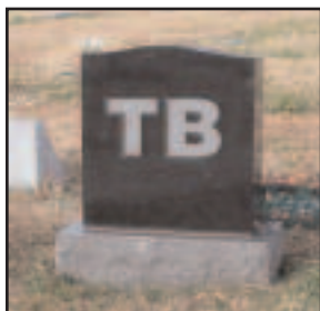
Penetrates the tough shell of the TB bacillus .

and as it kills HIV 1 (the AIDS virus) and pathogenic fungi. But RX 75 Wipes are not just to guard against cross infection.....the ability to penetrate the shell of the TB bacillus is indicative of its ability to penetrate and remove the worst stubborn soil. You'll find RX 75 to be the best cleaning "wipe" product you have ever used. They are ready to use right out of the handy tubs.