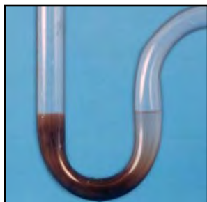
Digests fats and grease to prevent blocking of grease traps, drains and lines.

With RX 33, lines can be free flowing without use of hazardous chemicals, and without the vile job of hand cleaning. Add RX 33 manually or with easy to install, easy and inexpensive to operate, automatic equipment. Set the unit once and the computer memory will dispense just the right amount of product every day of the week, every week of the year.