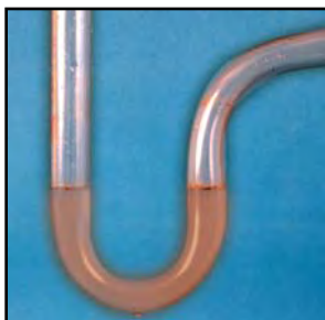
Bio-enzymatic action liquifies waste.....nature's way, but faster.