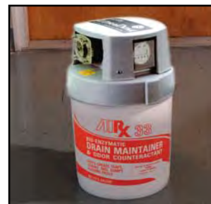
An environmentally responsible way to eliminate grease trap waste.