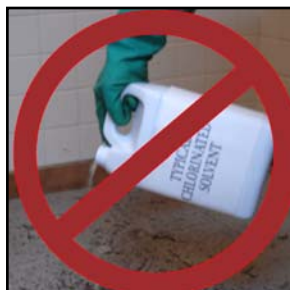
Replaces dangerous caustics and chlorinated solvents which harm the environment.